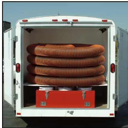
Integrated hose storage area provides ample storage for vacuum hose