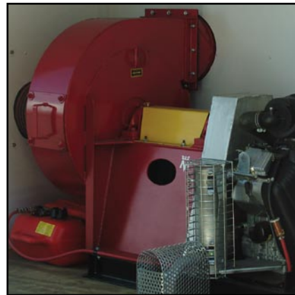
31 HP gas engine and heavy-duty, material handling fan wheel provide an unmatched combination air flow and static pressure needed to efficiently remove dust, dirt and debris from residential and commercial air handling systems