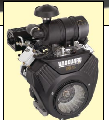
31 HP Briggs Vanguard OHV engine